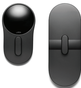
Latch Black Exterior, Latch Black Interior

Matte Finish Zinc Alloy Exterior & Turns Polycarbonate Lens & Battery Cover