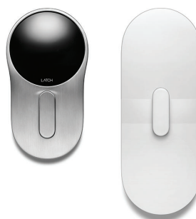
Satin Chrome Exterior, Latch White Interior

Matte Finish Zinc Alloy Exterior & Turns Polycarbonate Lens & Battery Cover