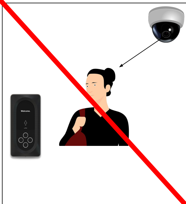
Back of head